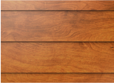
Nature 12" Lap Siding

Nature siding grooved panels are 96 1 / 16 " long, and are available in widths 12" or 8". They can be installed over metal or wood substructures using three pattern options: