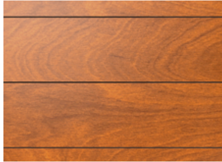
Nature 12" Siding