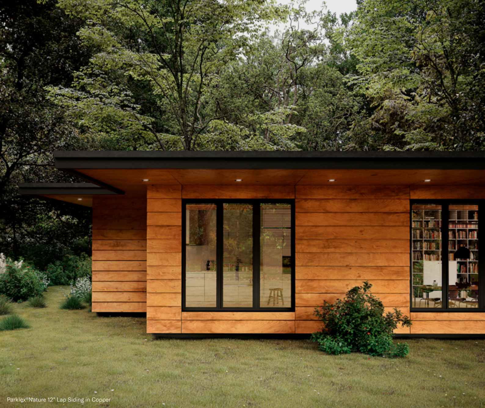
Parklex®Nature 12" Lap Siding in Copper

Feel safe at home, Nature siding panels are manufactured to guarantee the best possible performance under the most demanding weather and environmental conditions over time.