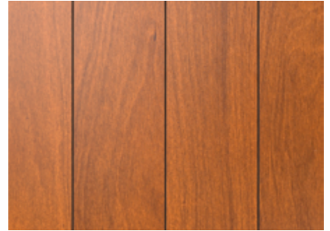
Nature 12" Vertical Siding