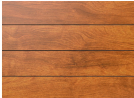
Nature 8" Siding